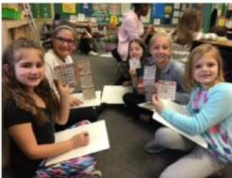
7th and 1st graders

As part of the on-going Prayer Partner program, students paired up to enjoy a few bingo games together during the Catholic Schools Week festivities.