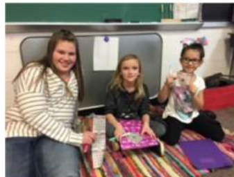
8th and 2nd grade students