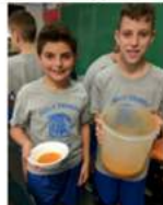
Tomato Basil soup (with bruised tomatoes)