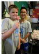
Watermelon rind popsicles

The 6 th and 7 th grade science classes are participating in the Fairchild Challenge, sponsored by Phipps Conservatory. This first challenge was for the 7 th grade class. Each group needed to come up with a recipe using discarded plant parts. (Fact – One-third of the food raised or prepared isn't eaten. This contributes to greenhouse gases and links to global warming.) The students not only made their plant-based recipe, but had to write how they were reducing food waste, what resources were used in producing the plants, and how they were reducing their household contribution to climate change. The top 10 recipes were added to our school's recipe book and submitted for judging. All challenges are totaled at the end of the year and prizes are awarded to the top schools. We are keeping our fingers crossed!