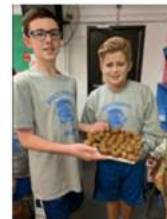
Muffins (with bruised apples)