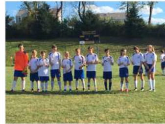
Congratulations to the 8th grade members of the soccer team!